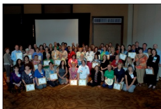
Keep Texas Beautiful Affiliates receiving gold star affiliate recognition at the 43rd Annual Conference.